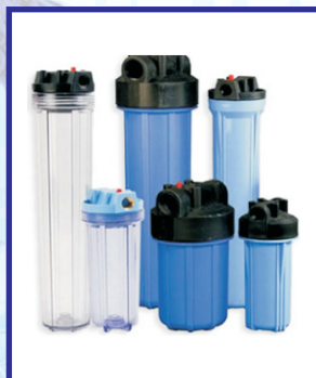
Cartridge Filter Housings