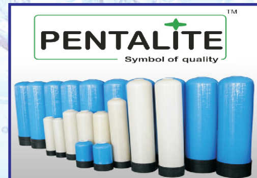
FRP & Composite Vessels